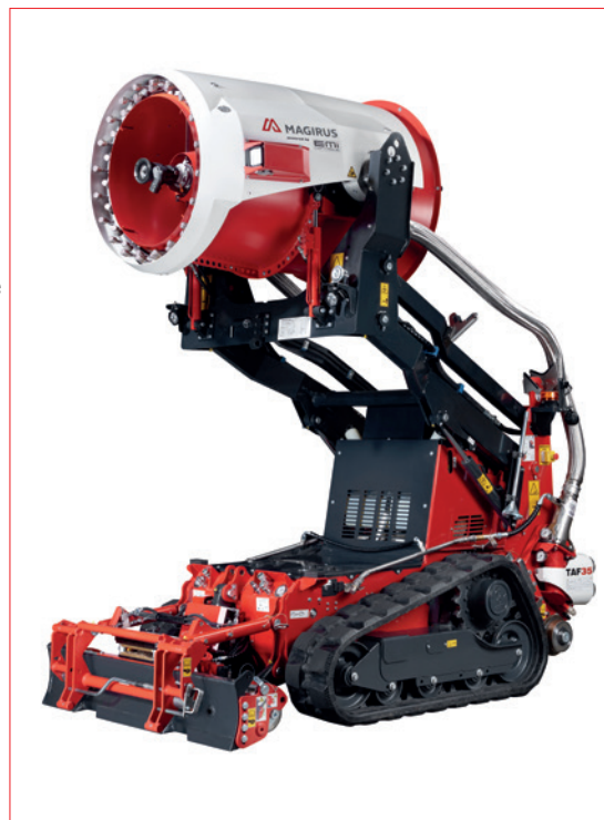
Lifiable and tiltable turbine

Illustrations may include additional options. We reserve the right to make technical changes or improvements at any time without prior notice. Errors and omissions excepted.