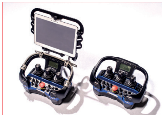
Remote control with a range of up to 300 m